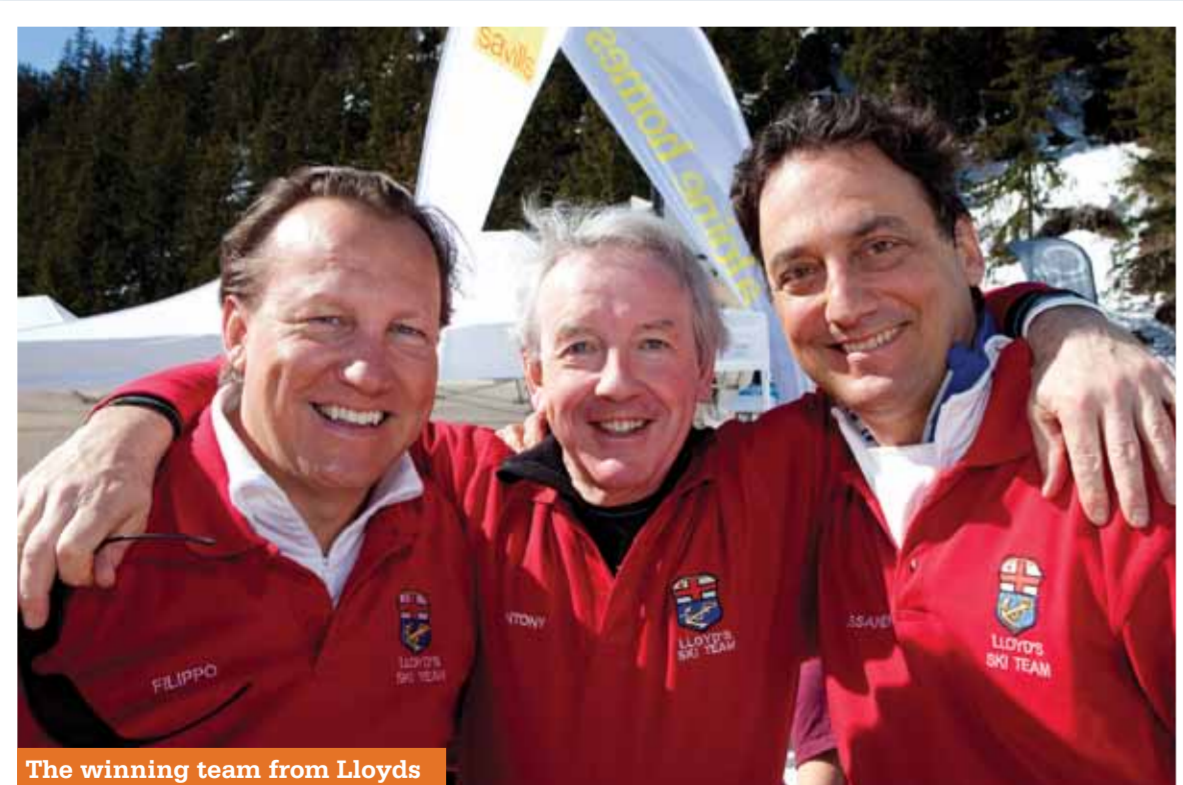
The winning team from Lloyds