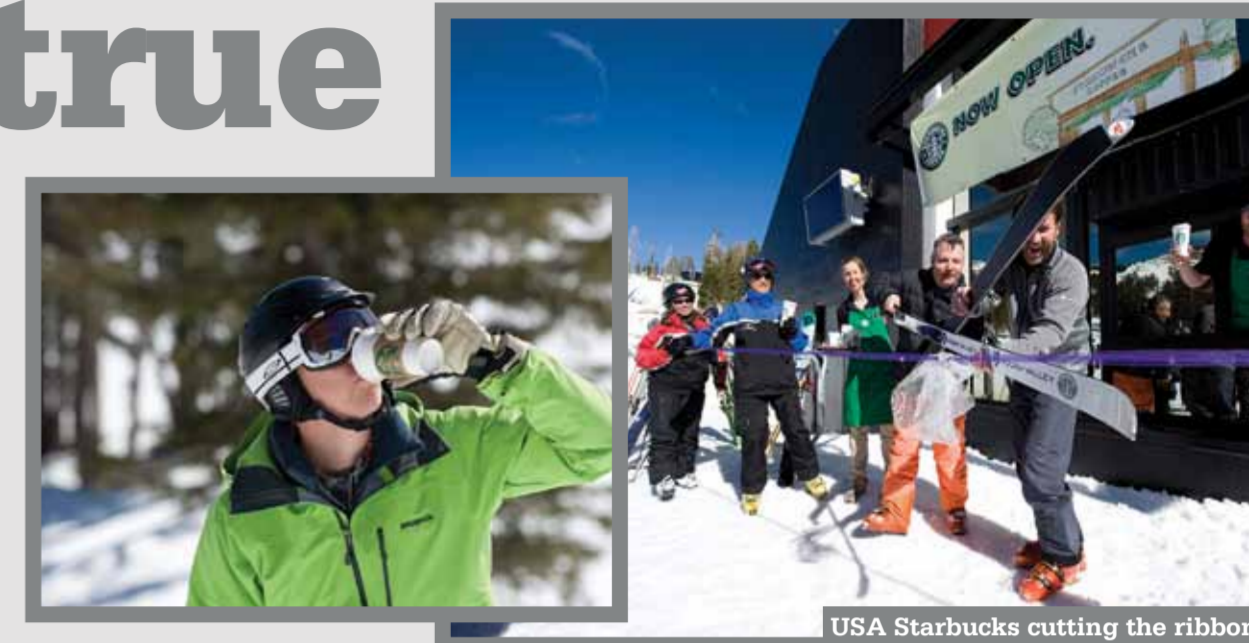
USA Starbucks cutting the ribbon

HEAVENLY/KIRKWOOD: Up to 9ft (2.7mtrs) of recent snow in the most powerful storm to hit the Lake Tahoe region this winter has given the two resorts chance to keep on skiing and boarding well into spring.